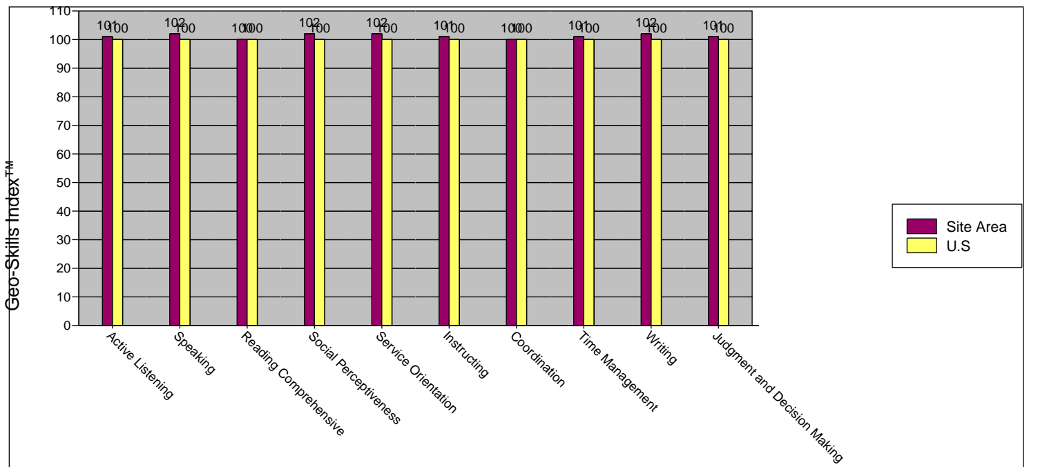
2007 Top Elder Living Skills